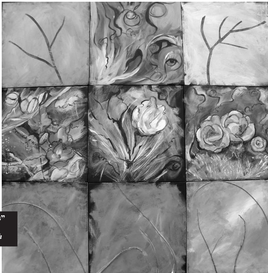
“Desert Beauties” Acrylic By Barbara Welch

Arts Council of the Conejo Valley Hillcrest Center for the Arts 403 W. Hillcrest Drive Thousand Oaks, CA 91360